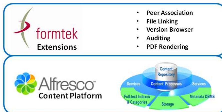
Figure 1: Formtek Extensions for Alfresco

Formtek has developed a set of extensions for the Alfresco® Enterprise Content Management (ECM) system. The Formtek PDF Rendering Extension product is one of the extensions offered by Formtek for the Alfresco content platform as illustrated in Figure 1.